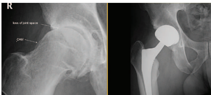
Figure 1(a): Osteoarthritis. Severe supra-lateral articular cartilage degeneration as a result of untreated chronic FAI

A 34-year-old, former inter-county Gaelic footballer (six years), was referred to the clinic with a history of persistent, severe pain in the right hip, which has come to affect his daily quality of life (sleeping, driving, any long journeys) for the last six months. At time of initial consultation, he was no longer able to play sports or run due to pain. He suffered from chronic, recurrent groin discomfort during his inter-county career. On examination, there was marked global stiffness and he had lost a significant amount of flexion, all rotation and adduction of the flexed hip. X-rays confirmed significant osteoarthritis. Due to increasing discomfort, limping and inability to perform daily activities, he decided to proceed with total hip replacement 11 months later.